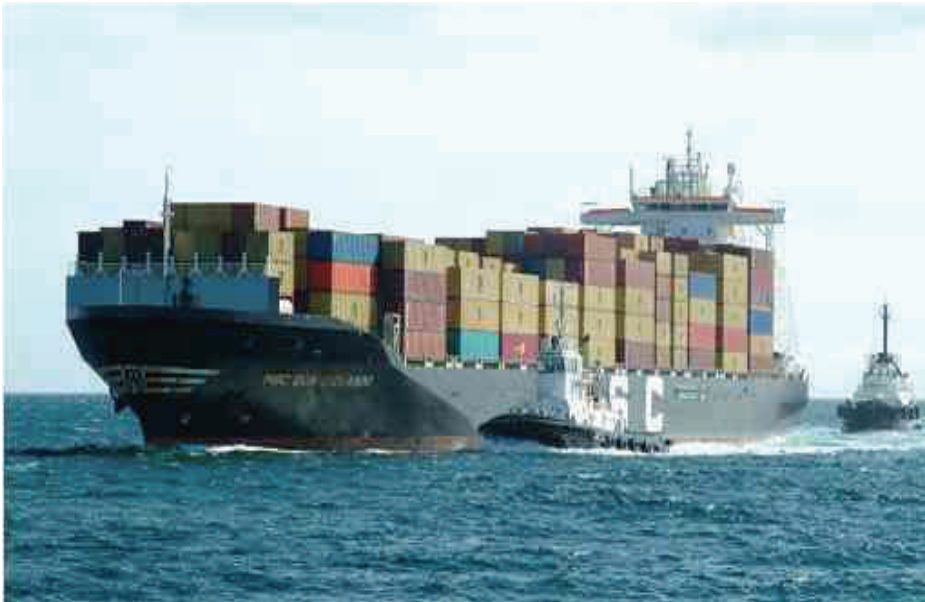
Developing countries are worried their exports will be curbed by climate related trade measures

burden of adjustment onto these developing countries.