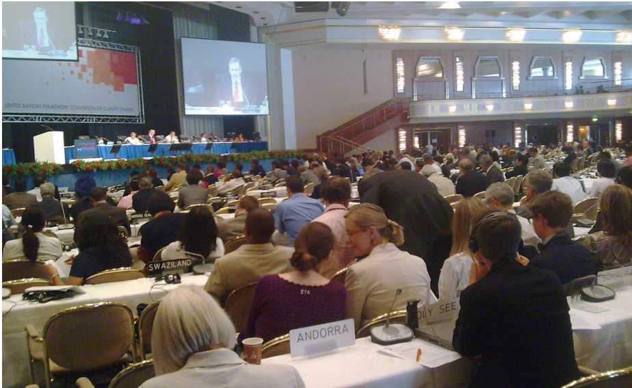
UNFCCC Session in Bonn in August

The Copenhagen conference on climate change in December should make clear that developed countries shall not make use of climate change to introduce unilateral trade measures against goods and services imported from developing countries.