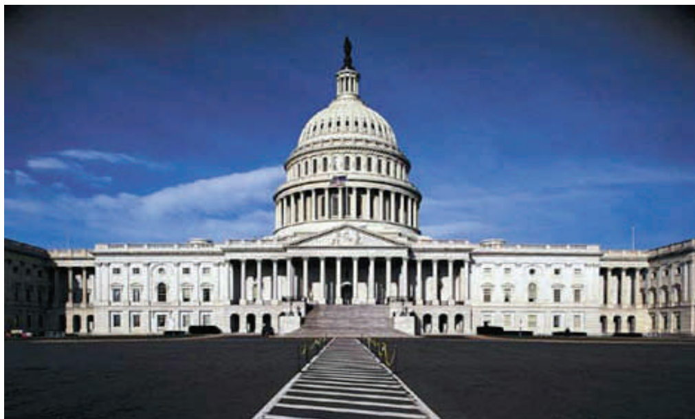
Recent US Congress bills contain trade and IPR measures against developing countries' interests