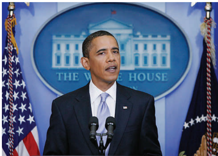
US President Barack Obama supported the US climate bill at a news conference in June

This section would insert a new “Part F” to Title VII of the US Clean Air Act, which part would be entitled “Ensuring Real Reductions in Industrial Emissions.” This new Part F has two subparts: