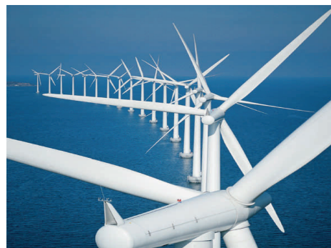
The South must have access to technology

A call to share technology has also been made by the US Energy Secretary Steven Chu. A New York Times article titled "Energy Chief Seeks Global Flow of Ideas" (March 2009) reported Chu as stating: "If countries actively helped each other, they would also reap the home benefits of using less energy. So any area like that I think is where we should work very hard in a very collaborative way - by very collaborative, I mean share all intellectual property as much as possible. And in my meetings with my counterparts in other countries, when we talk about this they say, yes, we really should do this. But there hasn't been a coordinated effort."